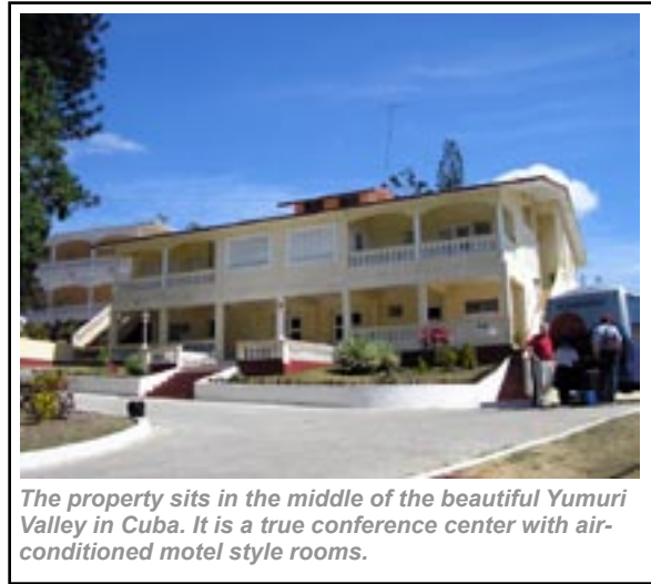
The property sits in the middle of the beautiful Yumuri Valley in Cuba. It is a true conference center with air-conditioned motel style rooms.

The Baptist Camp has developed into a truly remarkable facility under the leadership of Lazaro Cue. The property sits in the middle of the beautiful Yumuri Valley. You can walk up to a summit on the property where you are able to see for miles