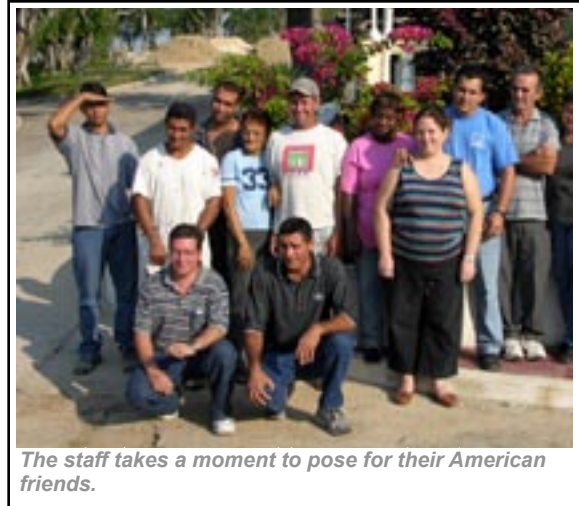
The staff takes a moment to pose for their American friends.

Over the past several decades the camp has developed into a true conference center with air-conditioned motel rooms. There is also a brand new dining room that can seat up to 300 and a second floor auditorium that can seat up to 600. Lake Yale has been able to take a number of its staff over the past two years to provide some much needed work. Projects have included renovations of the main bathrooms, the construction of the dining room and auditorium, interior and exterior painting, and the digging of a cistern to increase the water supply to the facility. The teams have also had opportunities to associate with the Cuban Baptists, including the children who love to come and play on the grounds after school.