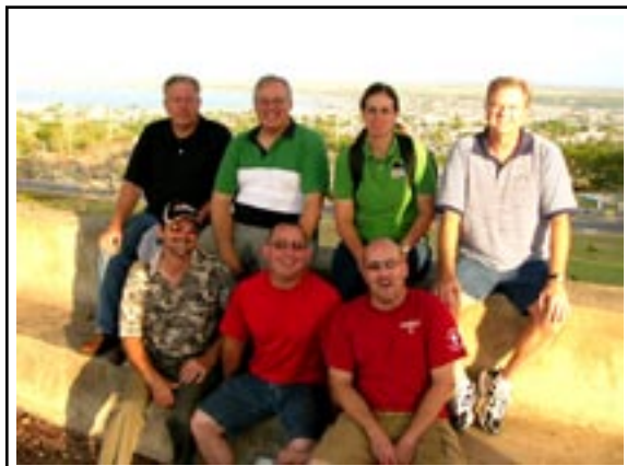
Members of the Lake Yale Conference Center team had the opportunity to share their skills at another camp that is in great need of support.