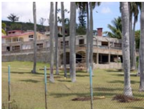
The Staff from Lake Yale helped construct the new dining room which seats up to 300 and an auditorium that will seat up to 600 at one time.